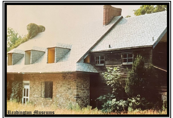
THE VAN HORNE HOUSE PRIOR TO THE 1988 FIRE.