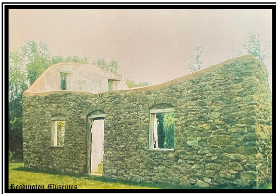
THE VAN HORNE HOUSE AS IT STANDS TODAY (CLOSE TO THE LAKE CUSHETUNK CLUBHOUSE).

The house had a center hall, with four rooms on the ground floor. Three of the rooms had corner fireplaces. The surround of one of these fireplaces was adorned with beautiful Dutch Delft tiles.