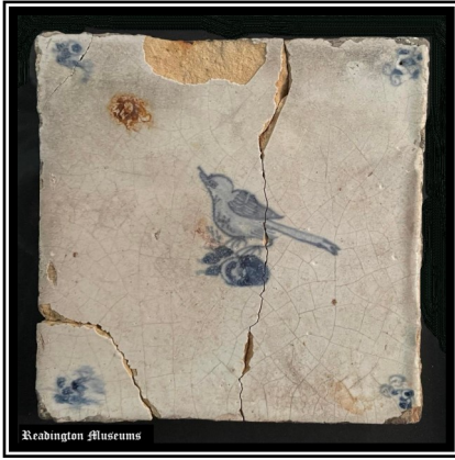
EACH 18TH C. TILE IS MADE WITH TIN GAZED EARTHENWARE.

Readington Museums shares a glimpse of Readington's Dutch heritage with our historic Dutch tile collection. A new exhibit, now on display in the lobby of the Readington Township Municipal Building, showcases the museums' collection of 18th c. Dutch Delft Tiles. The tiles were recovered from the former Van Horne House ruins, located off Van Horne Drive in Readington. Included in the exhibit are the recovered tiles, a picture of the tiles surrounding the fireplace, as well as pictures of the Van Horne house before and after the fire. The exhibit is free and open to the public between 9:00 a.m. and 4:30 p.m.