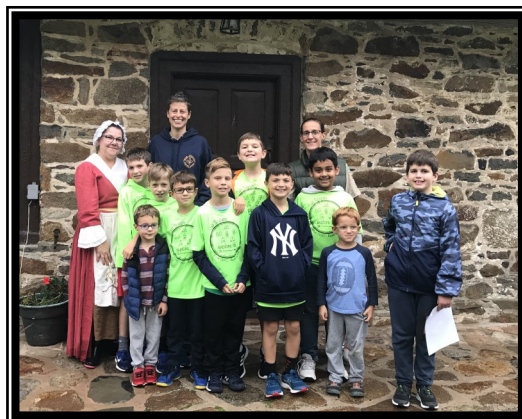
SCOUT PACK 1980 BEAR DEN VISIT THE BOUMAN-STICKNEY FARMSTEAD AS PART OF THEIR PAWS FOR ACTION ADVENTURE.