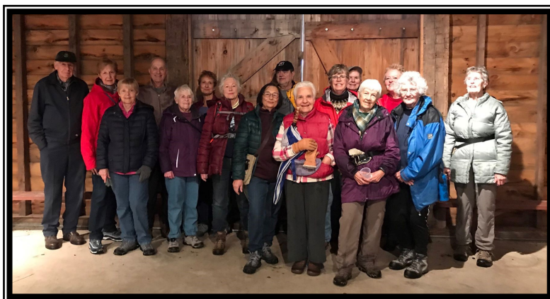
HUNTERDON HIKING CLUB HIKES THE OPEN SPACE TRAILS OF THE BOUMAN-STICKNEY FARMSTEAD AND TAKES A TOUR OF THE MUSEUM BUILDINGS.