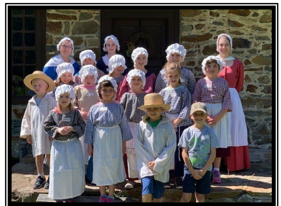
SUMMER "HANDS ON HISTORY" PROGRAM PARTICIPANTS.