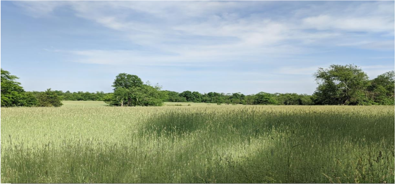
Saums Farm, Rockafellows Mill Road – Preserved by Readington Township in 2020