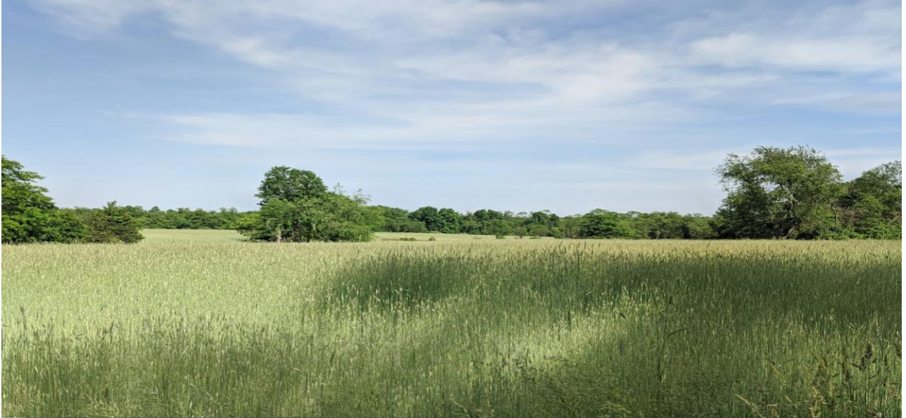
Saums Farm, Rockafellows Mill Road – Preserved by Readington Township in 2020