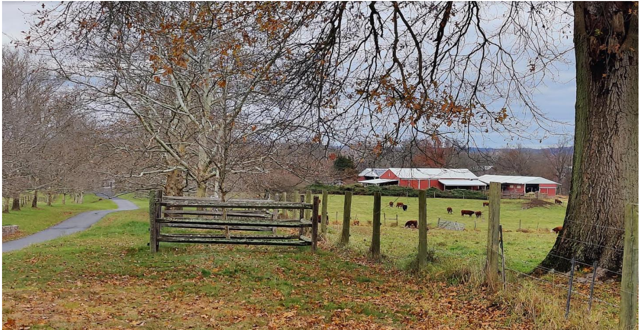
Barrettstown Joy Farm, Lamington Road – Preserved by Readington Township in 2024